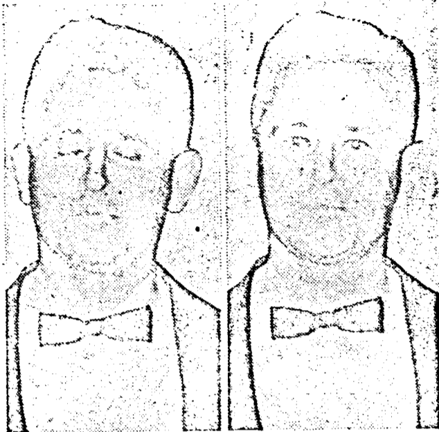
These are the FBI pictures of the man called Eric Starvo Galt. His eyes were closed in the original photo and an FBI artist sketched in the open eyes.