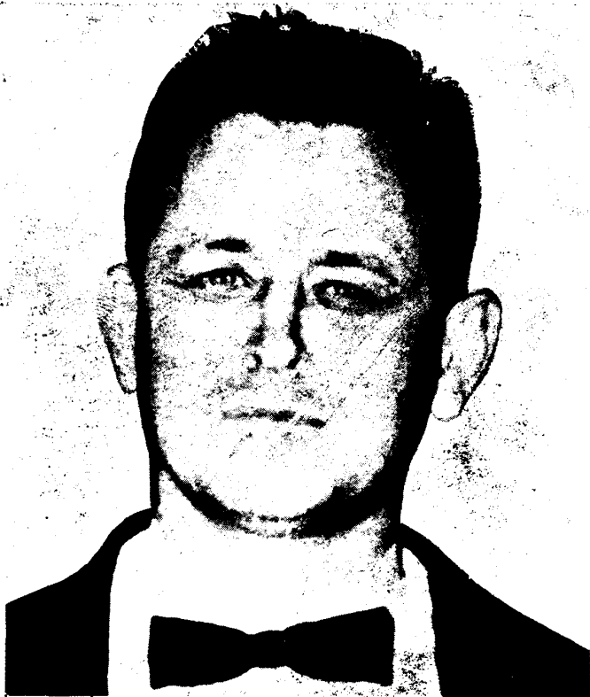
Photograph taken 1968 (eyes drawn by artist)