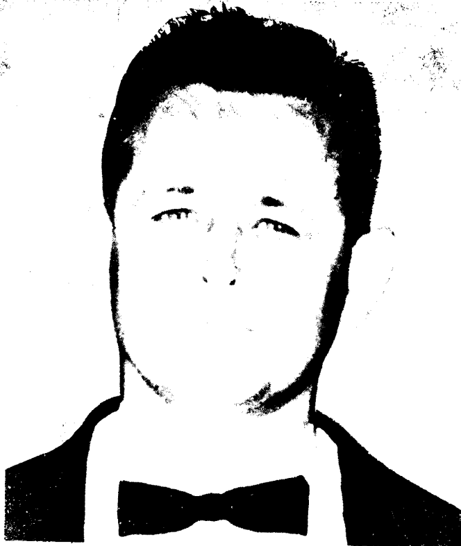
Photograph taken 1968 (eyes drawn by artist)