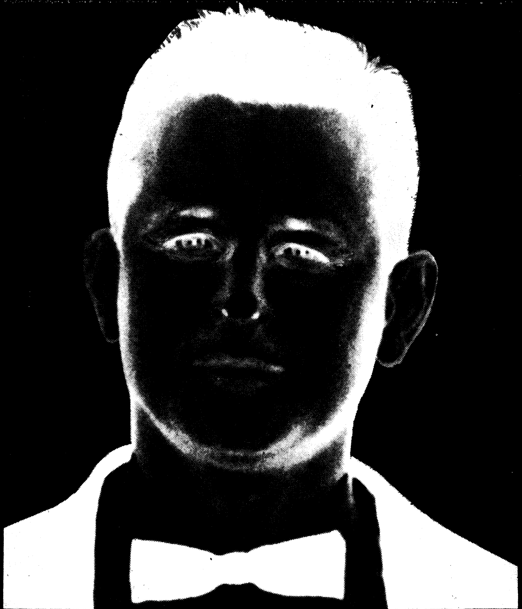
Photograph taken 1968 (eyes drawn by artist)