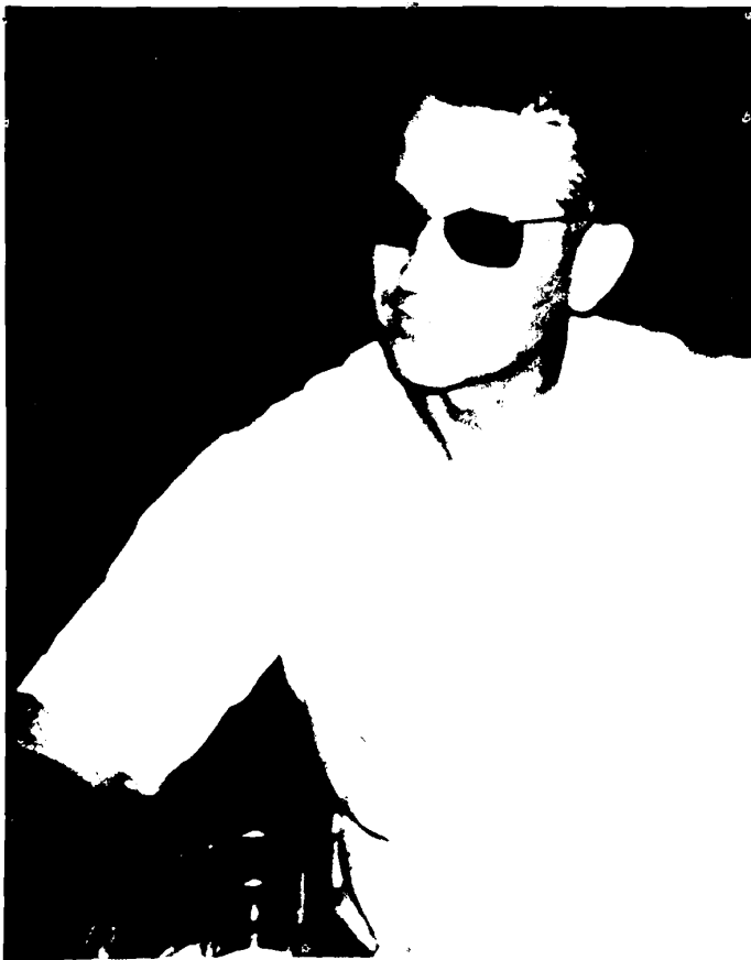
PHOTOGRAPH TAKEN 1967 IN MEXICO