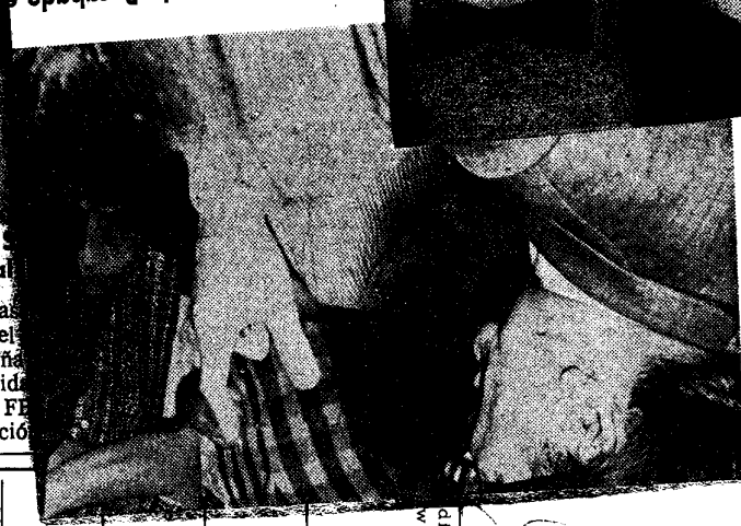
Esta es la fotografía Eric Starvo Galt, acusado de conspirar para asesinar a Martin Luther King.