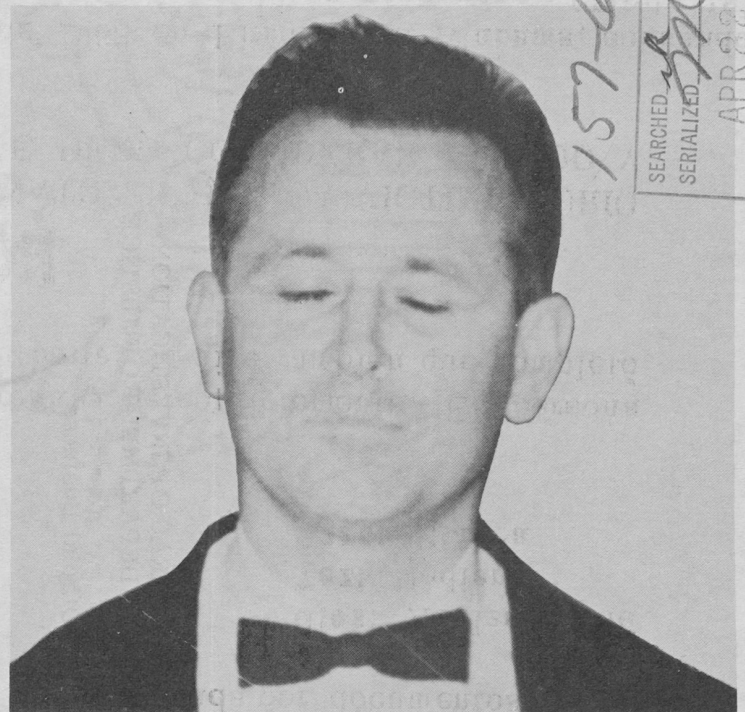
Fotografía tomada en 1968