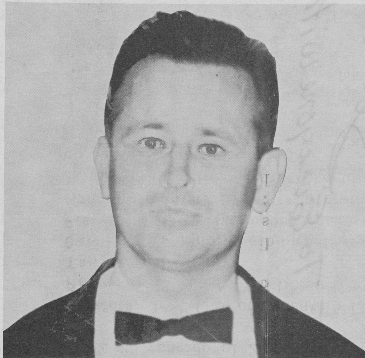
Fotografía tomada en 1968 (Los ojos son dibujados por un artista.)