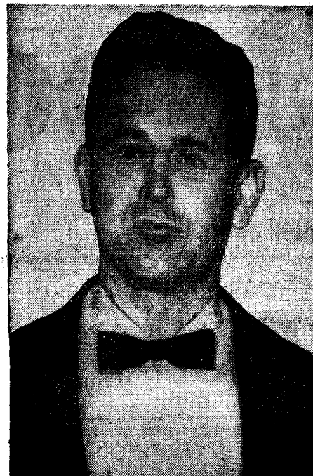
Esta es la fotografía Eric Starvo Galt cuya captura ha ordenado el FBI bajo acusación de conspirar para asesinar al Dr. Martin Luther King.

“se asociaron ilícitamente, asociación que continuó hasta el 5 de abril de 1968, para dañar, oprimir, amenazar o intimidar a Martin Luther King. El FBI dijo también que la asociación