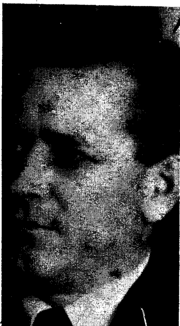
JAMES EARL RAY

Pottsville, Pa., asked the FBI to supply a dental chart of Ray to determine if they may match a corpse found there.