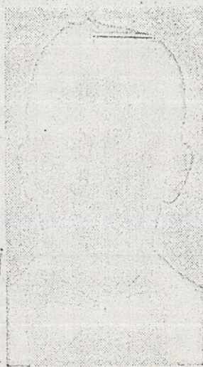
THE GALT-RAY PHOTO

The photograph of Ray—alias Galt—shows a man in a dark coat with his eyes closed. The FBI later painted