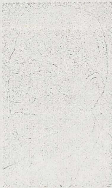
THE DALLAS SUSPECT