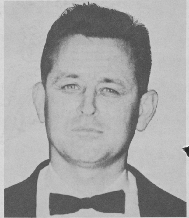
Photographs taken 1960