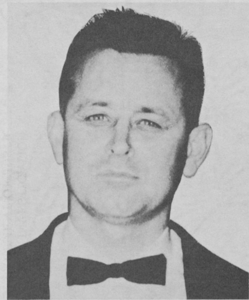
Fotografías tomada en 1960