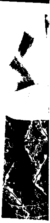
Photo of Shirts & T- Shirt showing red laundry tape found in room of Unsub.