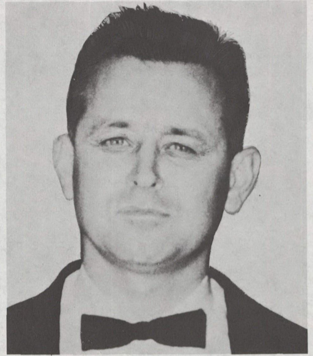
Photographs taken 1960