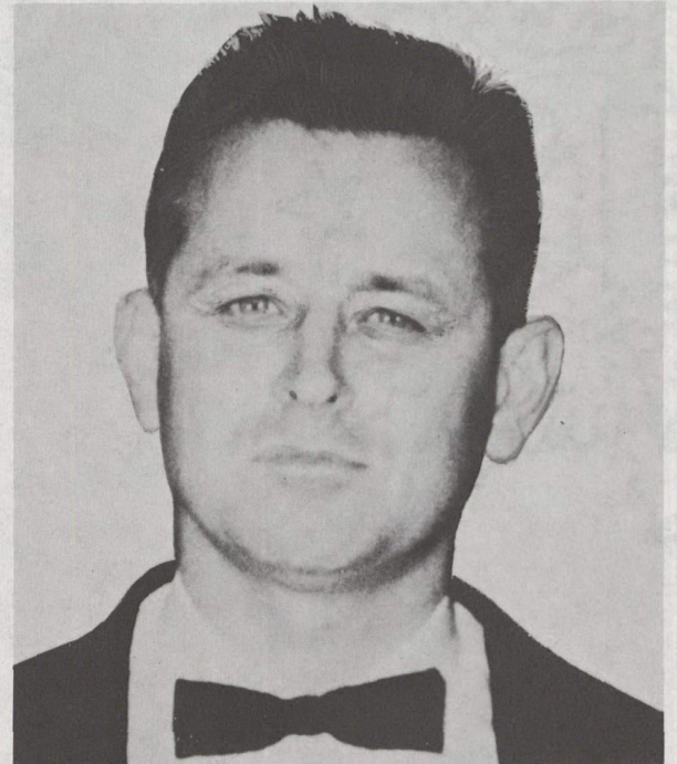
Photographs taken 1960