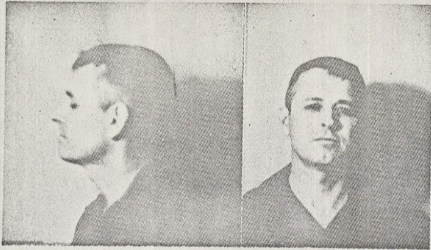
JAMES EARL RAY