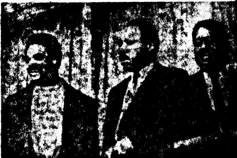
This picture of Dr. Martin Luther King Jr. was taken while standing with his two closest advisors, the Rev. Jesse Jackson and Dr. Ralph Abernathy, as they stood on the porch of the Lorraine Hotel.