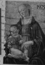
Ghirlandino: National Gallery Christmas US postage