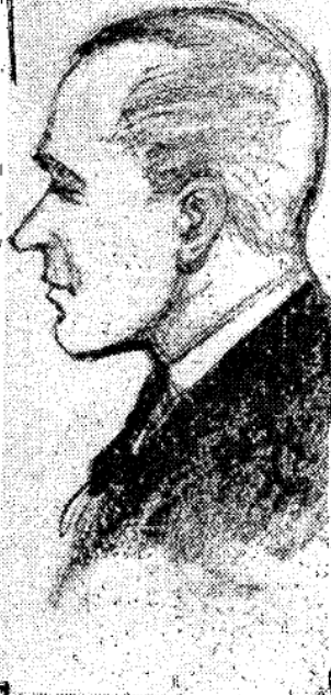
Artist's concept of slayer.

MEMPHIS, (UPI) — The search for the killer of Dr. Martin Luther King Jr., extended to Mexico today.