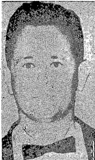
Eric Starvo Galt—trail cooled?

The FBI started hunting Galt a week ago. Agents even