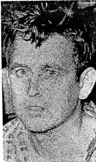
James Earl Ray—alias Eric Starvo Galt.

The FBI has said Eric Starvo Galt purchased a .30-06 rifle in Birmingham five days before the assassination. That rifle, with a telescopic sight