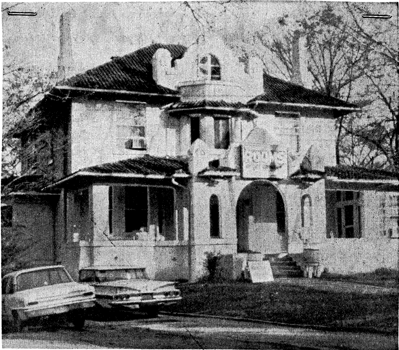
GALT REPORTEDLY STAYED HERE —The owner of this Birmingham rooming house says he has identified two sketches of a man sought in slaying of Dr. Martin Luther King as a roomer known as Eric Galt.