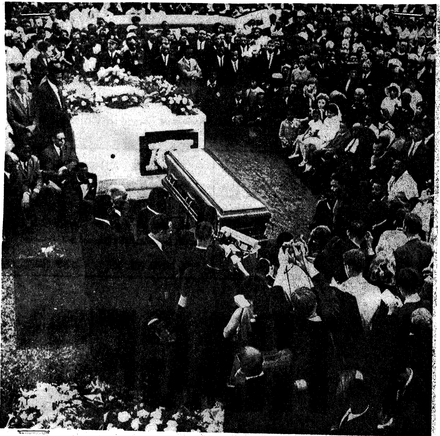
FUNERAL ADDRESS FOR DR. MARTIN LUTHER KING DELIVERED IN ATLANTA, GA. The family and friends, right center, were among 150,000 who attended services