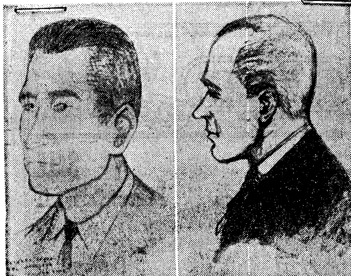
VIEWS OF SUSPECT —Sketches being used in the hunt for slayer of Dr. Martin Luther King include the one at left, being used by Mexican authorities based upon a description provided by the FBI, and the other, based on a description given by man who lives in building from where the shot was fired.

He said he had ignored reports from a "police lieutenant" that he was chasing a white Mustang. The lieutenant he named has denied making any such report and that he was involved in a chase.