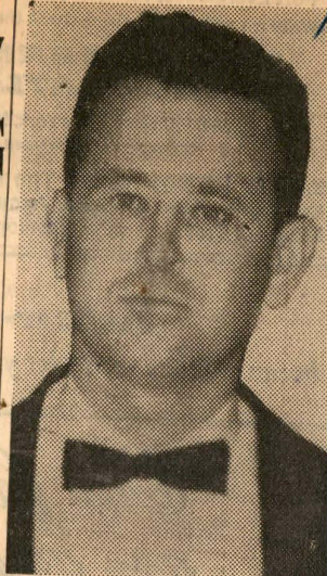
Man said to be Eric Starvo Galt. The eyes were painted in by an F.B.I. artist. Original picture is below.

Attorney General Ramsey Clark announced that Galt was being sought as a fugitive on the charge of having conspired to violate Dr. King's civil rights, in violation of Title 18, Section 241, of the United States Code.