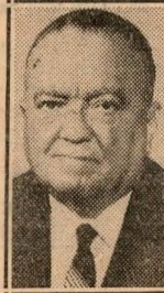
J. Edgar Hoover

The complaint on which the warrant was issued by the U.S. commissioner charged: