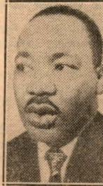
The late Martin Luther King