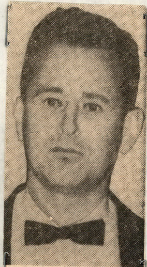
ERIC STARVO GALT conspired with "brother"