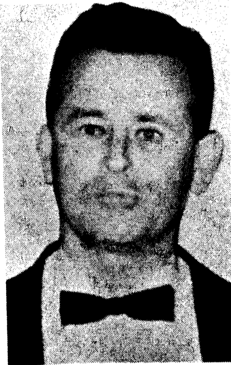
James Earl Ray

The state presented a handful of witnesses and, an hour and 55 minutes after the sudden trial started, Ray was convict-